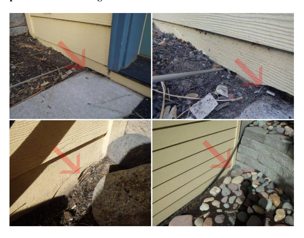
*$$$ Actions Estimated cost of correction is between $500 and $1500. None noted.

Some damaged material was noted that may have to be replaced. The most significant damage appeared to be located by the air conditioner unit and the entry to the downstairs office. We recommend further evaluation and appropriate corrections by a qualified licensed professional to prevent further damage or deterioration.